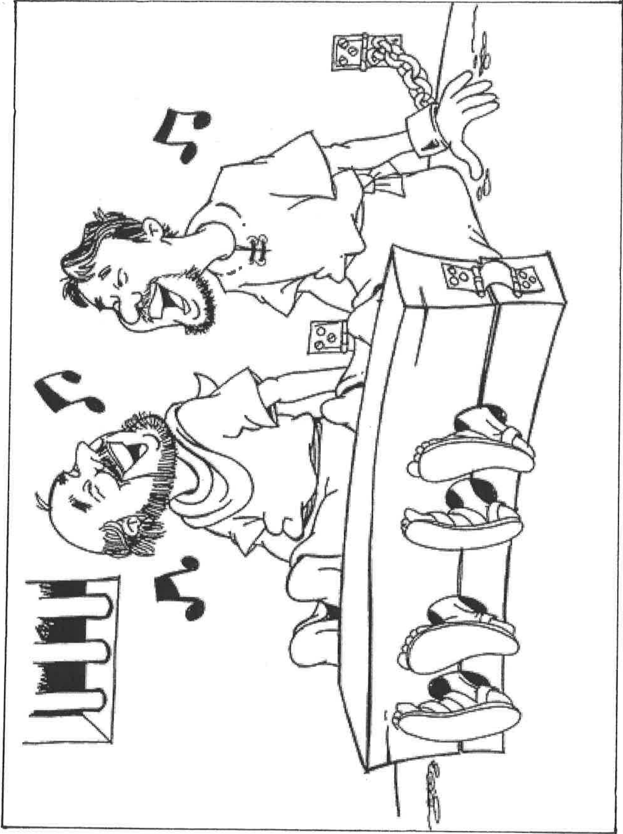
Paul and Silas Sing Praises in Prison